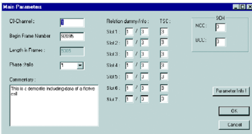
Settings of the basic parameters BCCH, timeslots and training sequence code (TSC)

2 W GMSK transmitters come in two models: